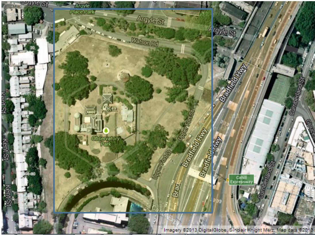
Google Satellite Map – Event Area